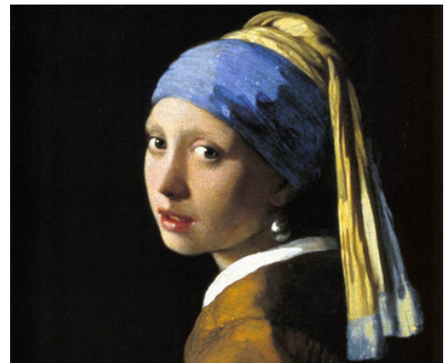
VERMEER, GIRL WITH A PEARL EARRING, CA. 1665.